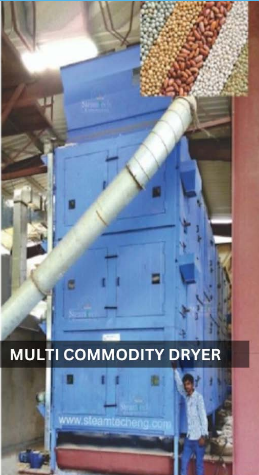
MULTI COMMODITY DRYER