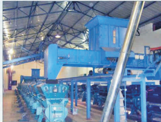
New Generation Trolley System