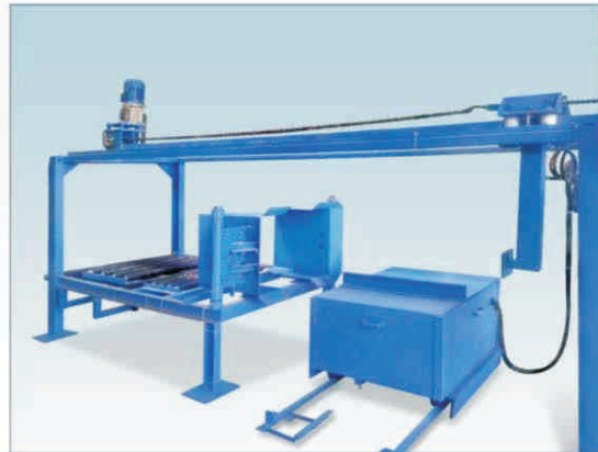
Bale Conveying System

611-Aalap-B, Opp. Shastri Maidan, Limda Chowk, Rajkot-360 001, Gujarat. India.