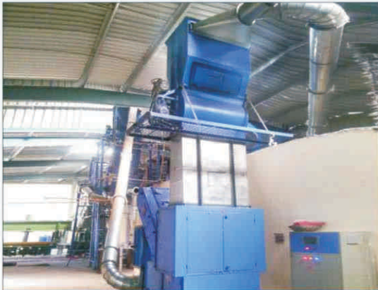
Air Separator Super Cleaner